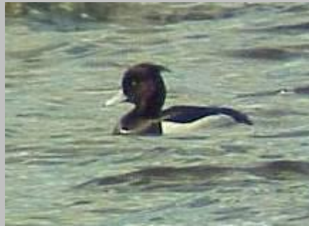
Tufted Duck [ Aythya fuligula ]