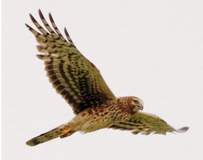
Northern Harrier - Female