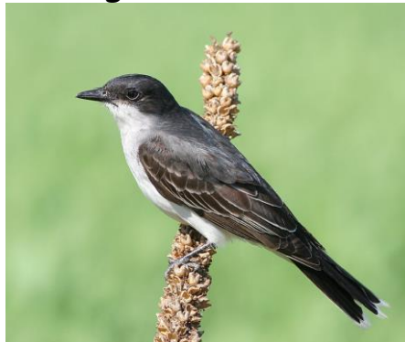
Eastern Kingbird

April 6, Tuesday, 7:00-9:00 p.m. Session II - Birding in the Field