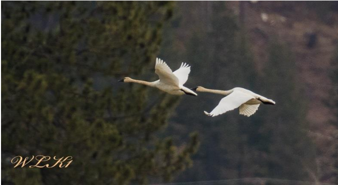
Tundra Swan flying over Killarney Lake February 16, 2016