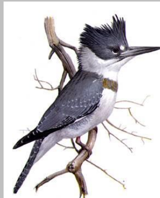
Belted Kingfisher Fuentes' Eastern Bird Collection

Audubon calls upon volunteers to join with birders across the western hemisphere and participate in Audubon's longest-running wintertime tradition, the annual Christmas Bird Count (CBC). Counts are open to birders of all skill levels, either by participating on a team out in the field or at their feeders. This year nearly 2,000 individual counts are scheduled to take place throughout the Americas from December 14, 2003 to January 5, 2004. (See page 2 and 3 for details about the three counts in our area. Volunteers are always welcome.)