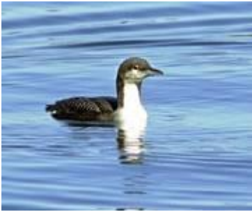
Pacific Loon – Photo by Wayne Tree

Crisp fall weather with larch and cottonwoods in brilliant yellow-gold, made for a perfect day to hike on Mineral Ridge. In both Wolf Lodge Bay and Beauty Bay, Bufflehead, Western Grebes, Horned Grebes, Common Mergansers and