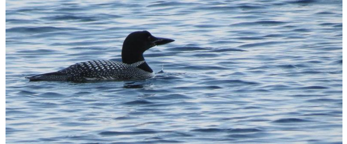
Common Loon