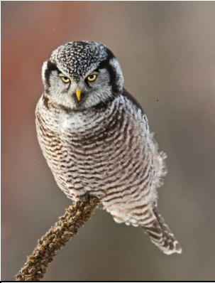
Northern Hawk Owl

From "Finding SUBIRDIA ", The Nature Conservancy Magazine , Feb/Mar 2015.