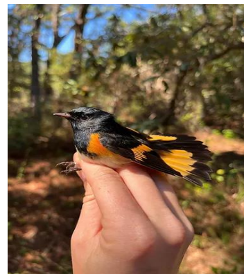
American Redstart Banded at Fort Morgan

The project raised awareness among volunteers of the need to protect these small migratory birds' "pit stops" from development.