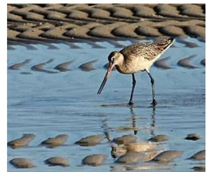
Marbled Godwit

The 14th annual Great Backyard Bird Count (GBBC) is coming up February 18-21, 2011. The four-day event is free and is open to bird watchers of all ages and skill levels. Participants watch birds for any length of time on one or more days of the count and enter their tallies at www.birdcount.org .