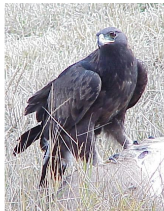
Golden Eagle