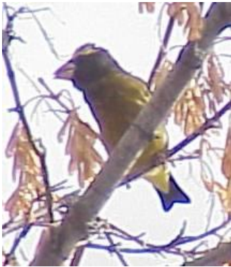
Evening Grosbeak

This year our count was our 2 nd lowest in species and individuals. The 2004 count was our lowest with only 36 species and 606 individuals. Our highest count was 57 species in 2002 and 1686 individuals in 1998. Our low count had a lot to do with cold and snowy weather.