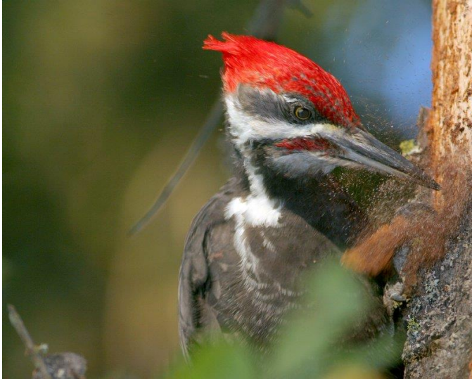
Pileated Woodpecker