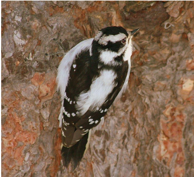
Downy Woodpecker

News release, December 2011--As moviegoers watch the stars of "The Big Year" in their quest to count birds, some may be motivated to try the hobby for the first time. The annual Great Backyard Bird Count is the perfect opportunity. The event is hosted by Audubon , the Cornell Lab of Ornithology , and Canadian partner Bird Studies Canada . The results provide a snapshot of the whereabouts of more than 600 bird species.