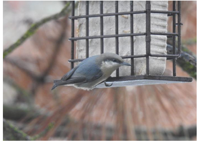
Pygmy Nuthatch at the feeder of Doug Ward

Saturday morning dawned bleak with rain threatening to put a stop to our second annual feeder field trip. But much to our mutual surprise, we totaled 11 members involved in the hunt one way or another. Five people had agreed to open their homes to a gang of friends with wet boots and coats, hoping to see interesting birds looking for breakfast. The feeders had been well stocked a week in advance to establish a target for hungry birds.