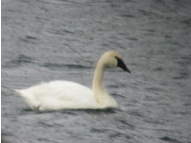
Trumpeter Swan – Taken on December 14, 2008 - Hayden Lake