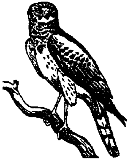
Northern Harrier a resident of Rathdrum Prairie

By the time you read this article, a few Audubon members will have attended the city of Coeur d'Alene Planning and Zoning Council public hearing (January 10) to discuss zoning annexation and development of Blackwell Island, primarily east of Highway 95. A conservation meeting will be held at 6:30 p.m., Tuesday, January 17, prior to the regular club meeting at 7 p.m. to discuss the council's actions and other issues.