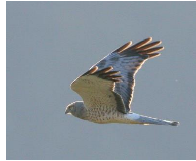
Northern Harrier (male)

They may not look like much in winter, but an aspen tree or aspen stand provides a wonderful food source for critters at a time when they need it most. So if you are thinking of planting some trees around your property, consider aspen. Not only do they provide beautiful fall foliage, but they have great value for our local wildlife species!