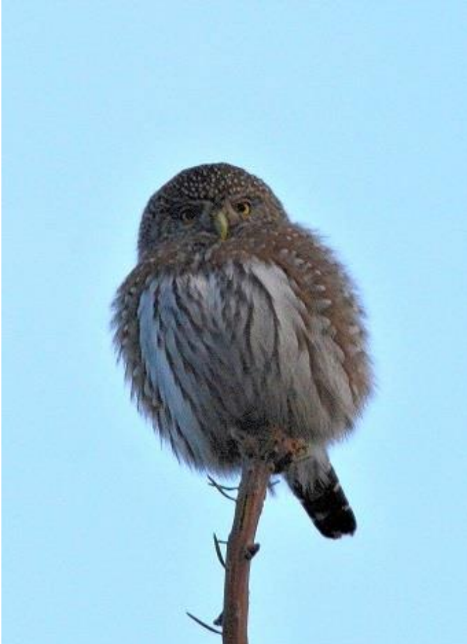
Northern Pygmy Owl