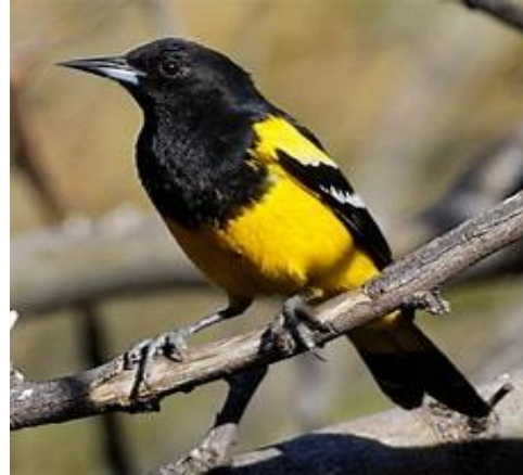
The Scott's Oriole, named for General Winfield Scott

This forced removal occurred in the 1830s and resulted in the deaths of more than 15,000 Native Americans along the way. It's known as the "Trail of Tears."