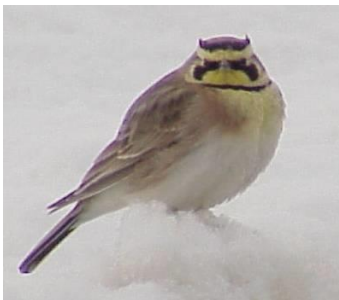
Horned Lark

In Reardan we found many Eurasian Collared-doves, a pair of muskrats sitting on the ice of Reardan Pond, and the location where Santa keeps his reindeer in the off-season.