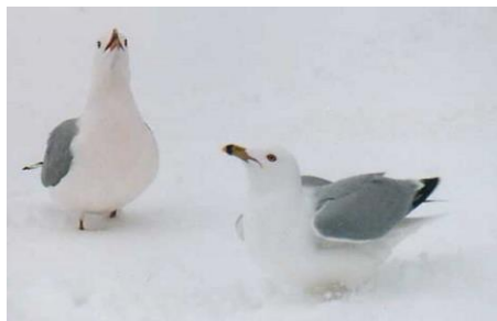
(Photo: - Pink Ring-billed Gull (left) on Sandpoint City beach )

A few ground rules: I'm restricting this analysis to just the eight full calendar years (2003–2010) I've been the editor of Birding . And I'm limiting myself only to full-length feature articles. In other words, all of those magnificent mini-essays ("News and Notes") by Paul Hess are straight-out disqualified. (But I can't resist noting that folks frequently tell me that Hess's column is the best thing in Birding .) As to my criteria, I can think of the following three, in increasing order of importance: (3) Is the subject matter interesting? (2) Is the writing good? (1) Did I learn cool new things from reading the article?