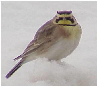
Horned Lark

In Reardan we found many Eurasian Collared-doves, a pair of muskrats sitting on the ice of Reardan Pond, and the location where Santa keeps his reindeer in the off-season.