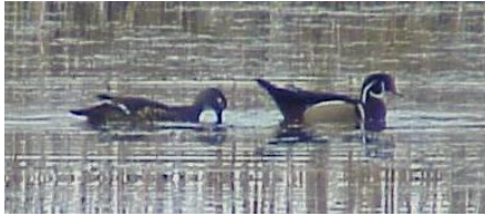
Wood Duck

24 hours in advance of the field trip to find out if the meeting place/time, or destination has been changed. Participants will share in a mileage reimbursement for the driver.