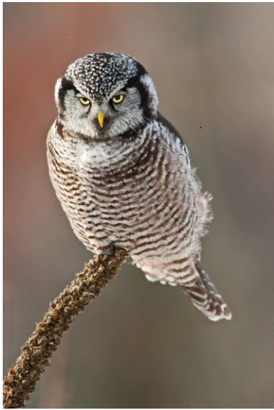
Northern Hawk Owl

Participants should contact the trip leader at least 24 hours in advance of the field trip for any changes in the meeting place, time or destination.