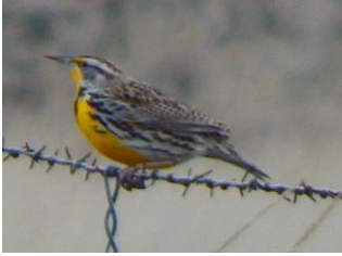
Western Meadowlark

Well, we did not find our target bird in the Lincoln County, WA area - a Snowy Owl. Three had been seen two weeks ago in the Swanson Lake vicinity