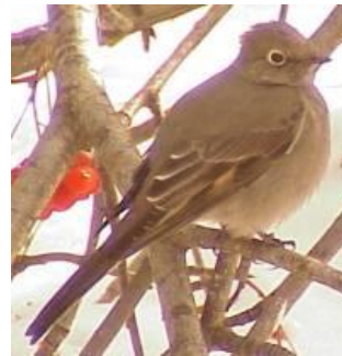
Townsend's Solitaire

We then headed back to the main highway to view the delta area from the other side, then stopped at the Trestle Creek Rec Area, which yielded a Common Loon, and five Red-breasted Mergansers (3 males and 2 females); neat ducks to see! We continued along the lake through Hope and Beyond Hope without stopping until Denton Slough. Many of the same waterfowl were seen there, plus the rain stopped so we could get out to bird with scopes. Of significance were 40 Tundra Swan, and we also picked up Ring-necked Duck, Lesser Scaup and Redhead on our way back.