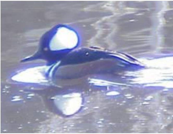
Hooded Merganser

Six hardcore birders traveled north in two cars on a very wet Saturday to see what we could find along the north shore of Lake Pend Oreille and east to the town of Clark Fork. We started birding along Sunnyside Road east of Sandpoint. We birded slowly by car over to the Pack River delta area, staying mostly in our cars because of the rain, and saw the usual waterfowl (Canada Goose, Mallard, Bufflehead, Hooded Merganser, Common Goldeneye, Horned Grebe, Pied-billed Grebe), none of which were in significant numbers. American Coot, however, were present in groups of many hundreds, as seems to be the case in that area. Other birds seen in this area were Common Raven, American Crow, European Starling, Rock Pigeon, Red-tailed Hawk, Northern Flicker, Red-winged Blackbird, Mourning Dove, Pine Siskin, House Finch,