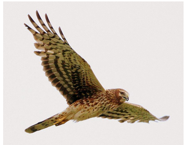
Northern Harrier