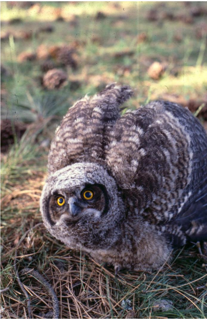
Great Horned Owl - Photo taken at the Wilhelm Farm. Huetter, ID. – this female had 2 young