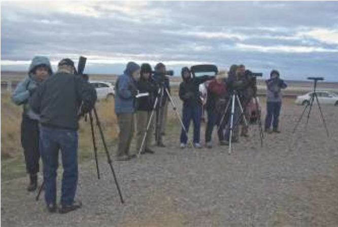
CDA Audubon field trip