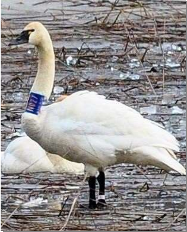
Tundra Swan with band – along the bike trail – Chain of Lakes – on March 8, 2014

I'm looking forward to visiting my second favorite place in the county-Harrison, and looking for birds along the bike trail.