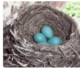
Robin nest