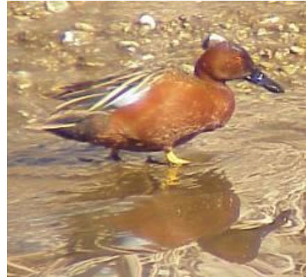
Cinnamon Teal

Spring finally arrived in the Idaho Panhandle in the form of a beautiful male Eurasian Wigeon near Hardy Loop in Cataldo. Water levels are high in most ponds and flooded fields this year, even though our big snowmelt has yet to occur. This