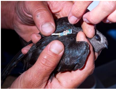
Researchers attaching geolocators on Black Swift.