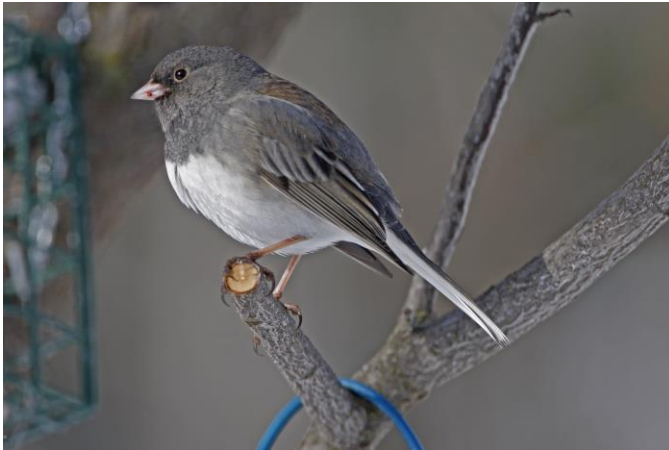
Dark-eyed Junco

The Coeur d'Alene Audubon field trip to Post Falls parks along of the Spokane River was very interesting and a change from our normal field events. We were fortunate that the weather cooperated with us because most of the day it sure looked like rain but it held off. All of the parks fronted on the Spokane River. A list of parks visited includes Corbin Park (where we watched people playing frisbee golf), an unnamed park south of Mcguire Rd. near Breezy Way, Falls Park, Q'emiln Park and Black Bay Park.