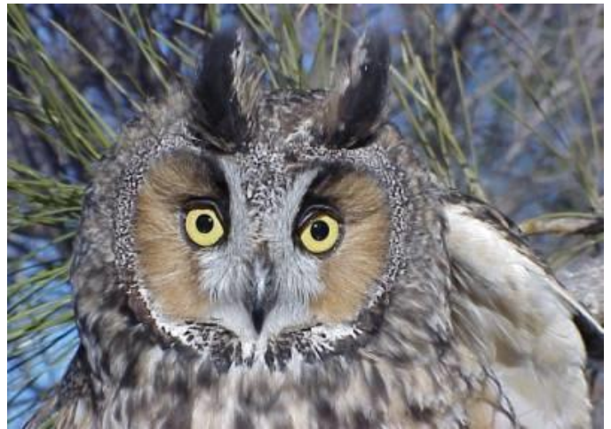
Long-Eared Owl

Many thanks to all those who gave of their time, talent, possessions and treasure to make the event a success, and a thank you to the Greenbriar staff for helping to make the evening a pleasurable one.