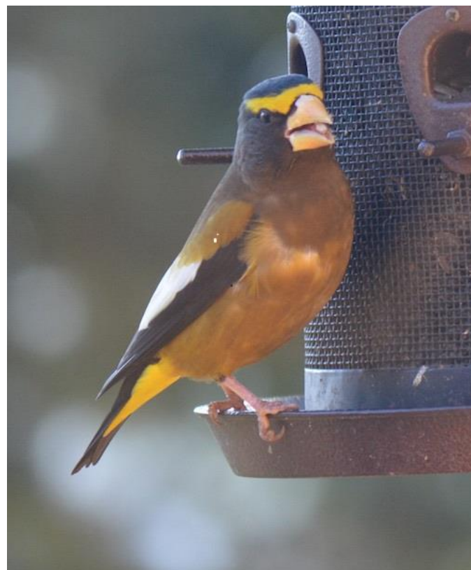
Evening Grosbeak – Photograph by Jaquith Travis Hauser Lake fall 2014

It seems that every year at this time I am a bit frantic, feeling as if there is so much work to do and not enough time in which to do it. There is the garden produce to attend to, compost to move, garden to mulch, branches to stack, plants to move, hoses to pick up, hay to get in, water lines to winterize, etc., etc. I must get it all done before freezing temperatures set in and it is too late.