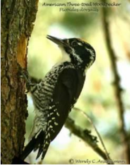
AMERICAN THREE TOED WOODPECKER AT NEST HOLE ON SHEPARD LAKE IN JUNE

2004 Kootenai County Big Year. The chapter website list will be updated weekly with the new birds being seen. Our total to date is 187 as of August 10