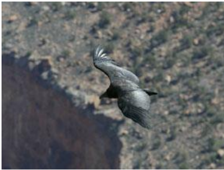
Condor 305, the only wild hatched condor in the world never touched by human hands.