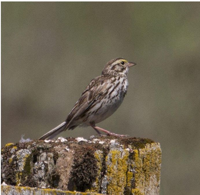
Savannah Sparrow - - not the bedraggled one on the Century Count©