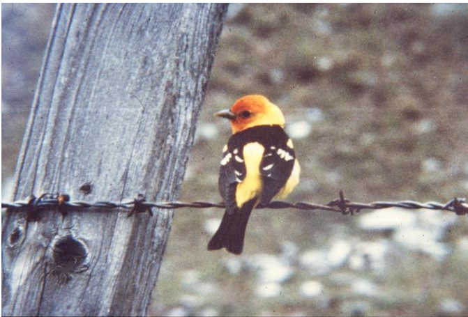
Western Tanager - June 1982 - Riggins

Fourteen Audubon birders trekked to Selkirk House in the Kootenai Valley for a weekend of spring birding. May 20-22 is a time for catching returning migrants, although a few were still absent at this time. As usual, there were surprises and misses for everyone. A total of 93 species for the weekend was not bad!