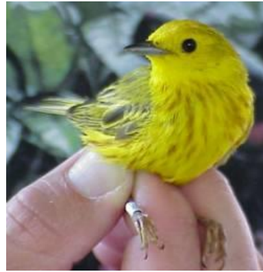
Yellow Warbler