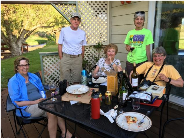
After a full day of birding – relaxing at Challis Hot Springs

We traveled one thousand, four hundred and seventy-six -miles of fantastic beauty with sagebrush, blue skies, good friends and good birds. Our first planned stop was Camas National Wildlife Refuge, followed by a visit to Market Lake Wildlife Management area. Among the 44 species in both areas were White-faced Ibis, Swainson's Hawk, Franklin's Gull, Willet and a pair of courting Western Grebe. In Pocatello, longtime Audubon activist, Chuck Trost joined us for dinner. On day three we headed to Gray's Lake National Wildlife Refuge, but first was a stop in Soda Springs just as the town's geyser was about to erupt with carbonated water. Well worth a visit. While a significant nesting site for Sandhill Cranes and Franklin's Gulls the numbers of visible birds were limited at Gray's Lake. We then traveled south to Bear Lake where waterfowl, and shorebirds were visible in great numbers. We had some great close views