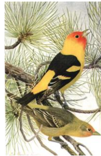
Western Tanager Fuyertes

We trekked north along the Moyie River through areas most had never visited, arriving at the Copper Falls trailhead near the Canadian border. The falls are reached by a verdant trail and were gushing this May.