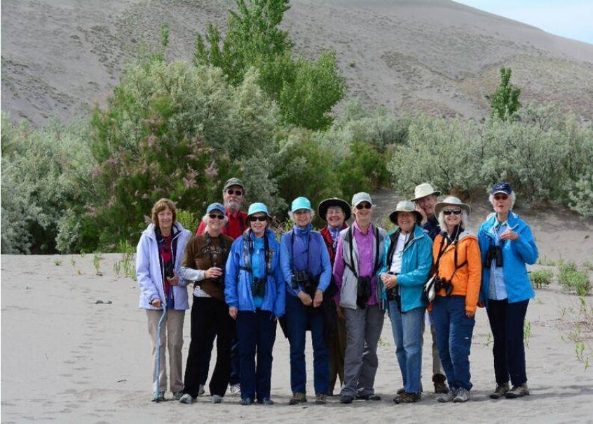
Ready to Climb a Sand Dune

We traveled 1416 miles, from approximately 700 feet elevation on Highway 95 at Lewiston, to 8700 feet elevation at Galena Summit on Highway 75 to Stanley. We followed the Salmon River, the Snake River, the headwaters of the Salmon, then the Bitterroot and the Clark Fork. From Skoocumchuk rest stop on the Salmon, where we saw a Bullocks Oriole and heard a Canyon Wren among several other birds, the fun continued. From Boise we visited Bruneau Dunes State Park, took a 1.3 mile hike around the lake, and climbed sand dunes. Highlight was a Lewis's Woodpecker. We then went onward to Three Island State Park and its