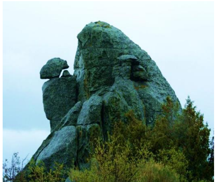
A BEAUTIFUL MOUNTAIN